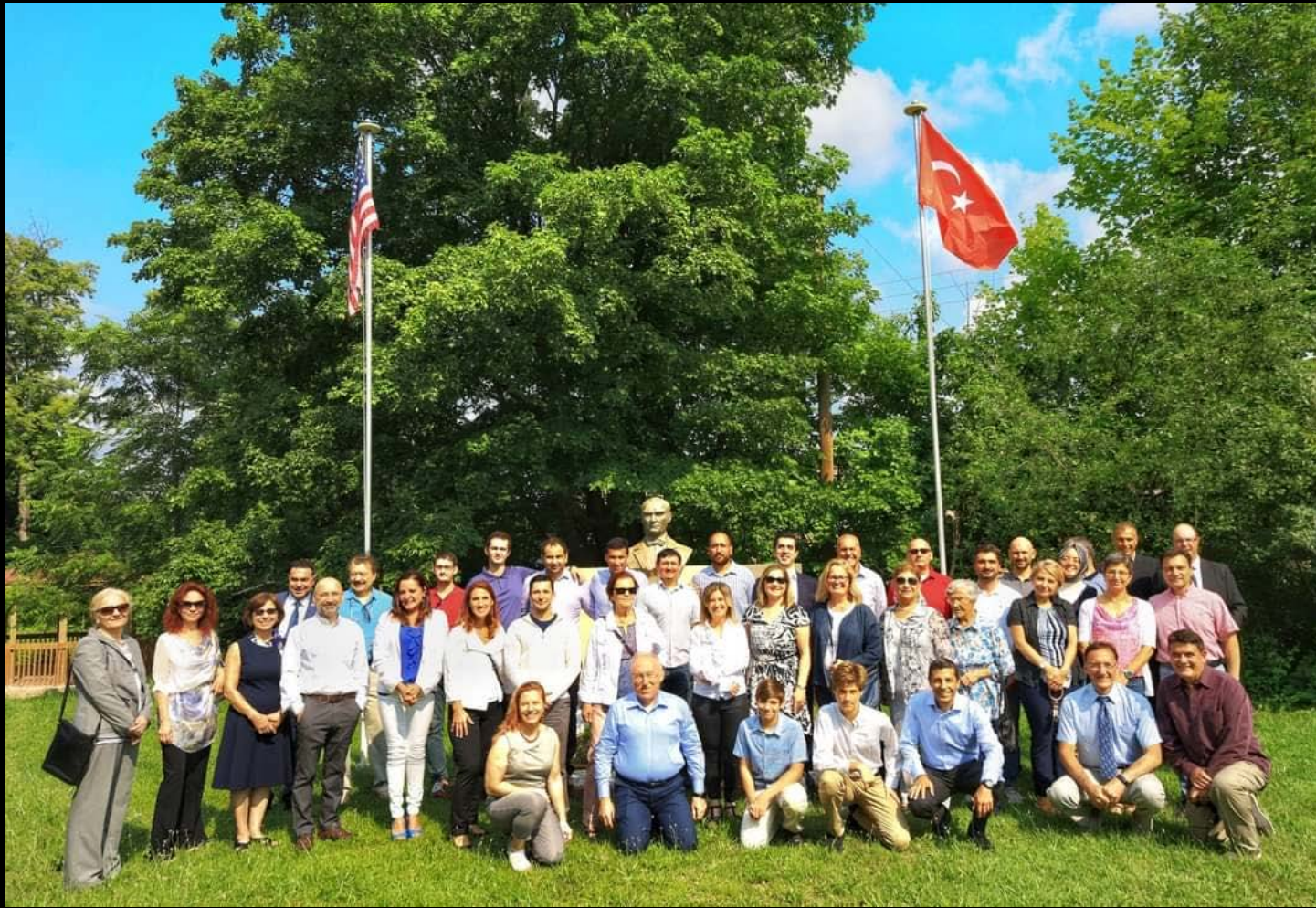
Visiting Ataturk Park at Turkish American Cultural Association of Michigan