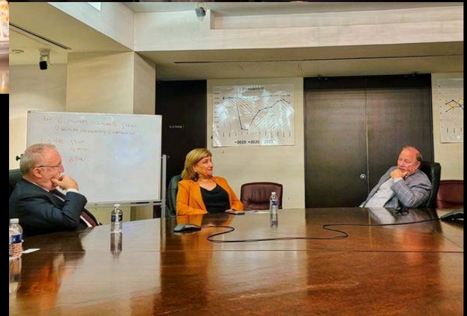
Detroit Mayor Mike Duggan