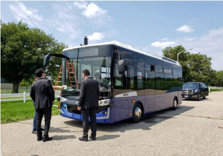
Visit by Turkish Ambassador to the United States, Hon. Murat Mercan