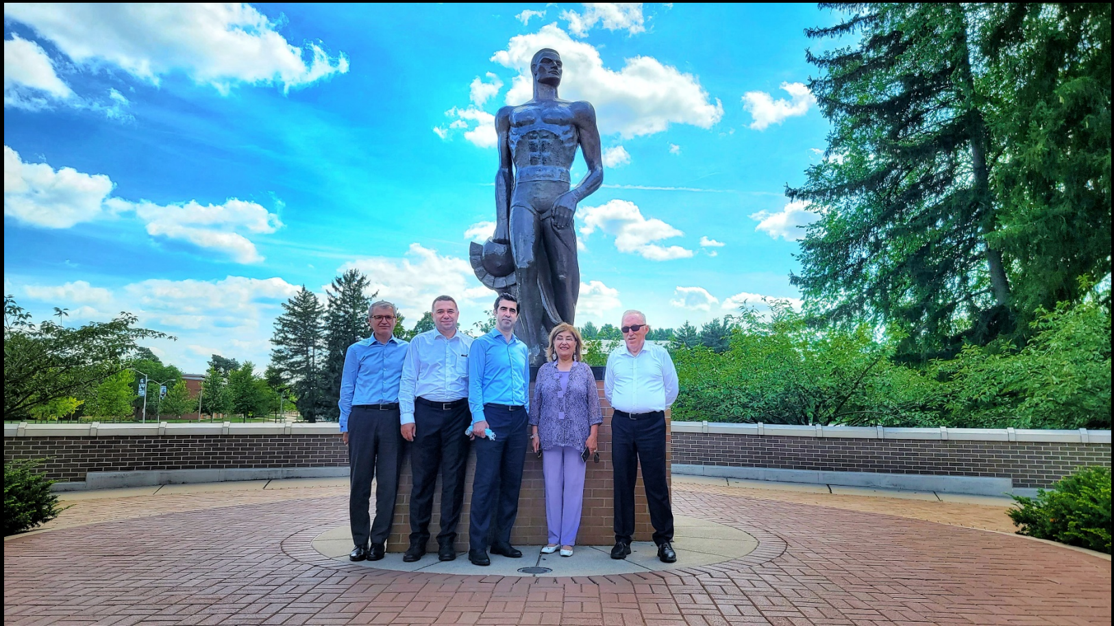
Visiting Michigan State University Campus