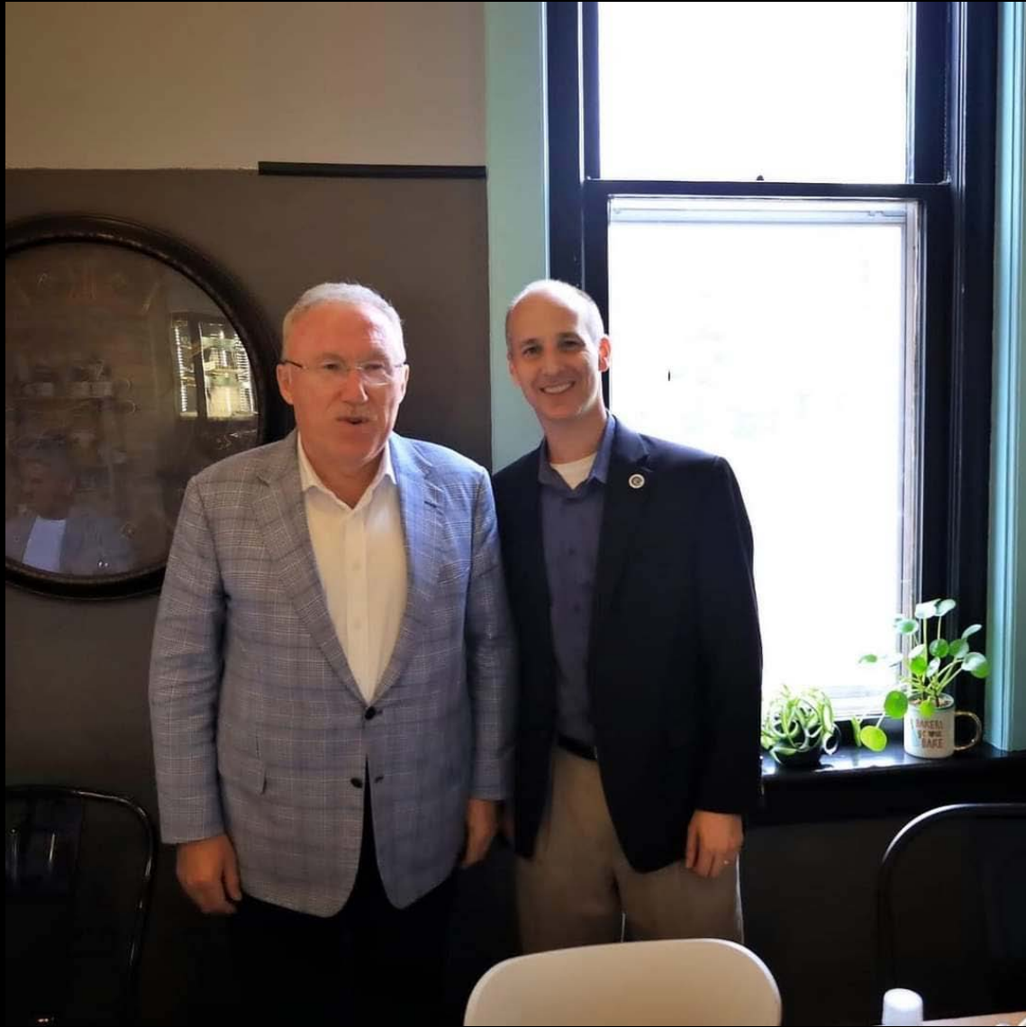
Visiting Mayor Andy Schor