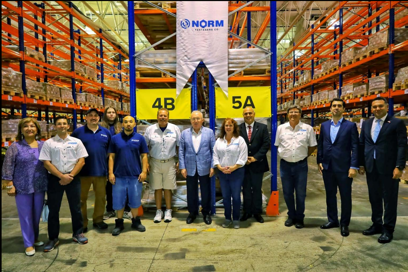
Visiting Norm Fasteners